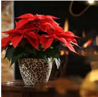
CHRISTMAS PLANTER $50